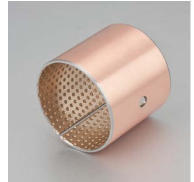
内外倒角 ID and OD chamfers